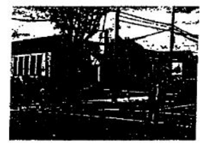
Students at 27 Salinas schools will lose the benefit of supervised street crossing as a result of the repeal of the Utility Users Tax.