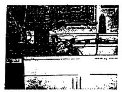
Methamphetamine lab. The proposed elimination of the Narcotics and Vice Unit will hamper Police Department's ability to promote the City Council's #1 goal of mathialining a safe and peaceful community.

Residents interested in learning more about the potential impacts to Police Services can visit the City's Web Site at www.ci.salinas.ca.us or pick up a copy of the City Manager's Littlity Users Tax report at the City Half or at any of the three City libraries.