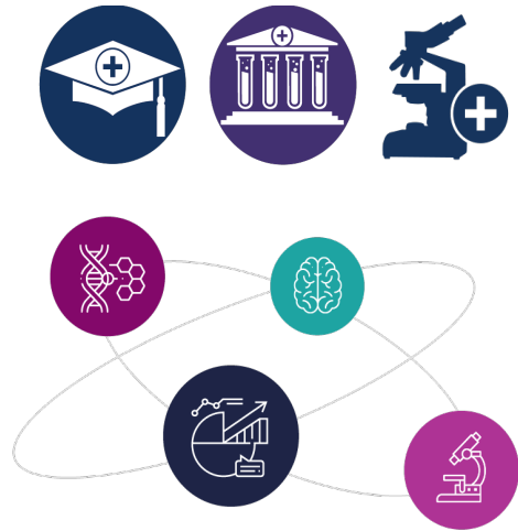
Open Science Community