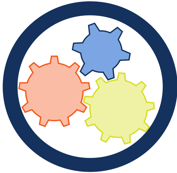
CIRM ReMIND Consortium