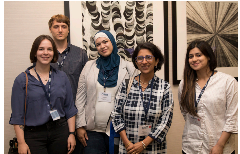
10 th Annual Bridges Conference July 2019, San Mateo, CA