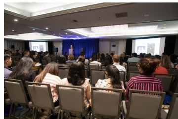
CIRM Annual Bridges Conference