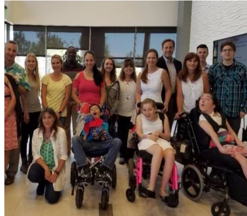
Patient Engagement and Community Outreach