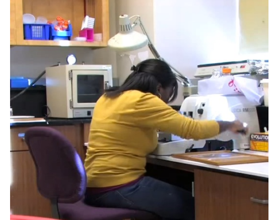
Paid Research Internships at Host Institutions Lab