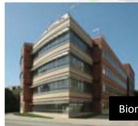
Biomedical Sciences Research Building (BSRB)