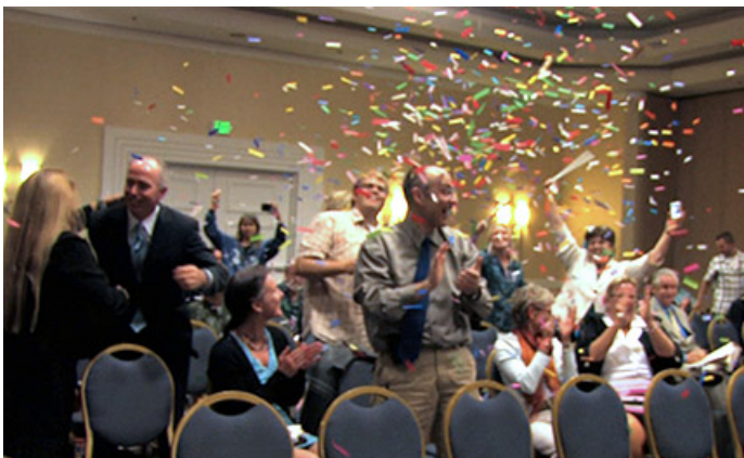
UC Davis Disease Teams and patient advocates celebrate approval of grant applications

On July 26th, the CIRM governing board approved $150 million in new funding to help move promising stem cell-based therapies from the laboratory research phase to clinical trials in people. The grants, up to $20 million per applicant, go to teams of researchers in both academia and industry who have been working on projects that represent the best possible chances of producing therapies for deadly and disabling diseases and disorders which include Huntington's disease, metastatic melanoma, osteoporosis, critical limb ischemia, spinal cord injury, ALS (Lou Gehrig's disease) and cardiovascular disease. The funding is part of the Disease Team II awards which are designed to encourage multidisciplinary teams of researchers from academic institutions, medical centers and industry to work together and to develop new treatments for a broad range of therapies.