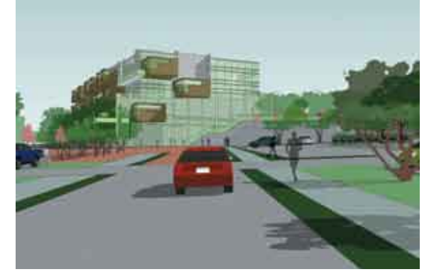
THE INVESTMENT OF $43 MILLION FROM CIRM AND $112 MILLION FROM DONORS AND INSTITUTIONS WILL BRING DIVERSE SCIENTISTS TOGETHER TO DEVELOP NEW TREATMENTS FOR DISEASE.

The balance of the construction costs will be raised by members of the consortium, which includes UCSD, The Scripps Research Institute, the Salk Institute for Biological Studies and the Burnham Institute for Medical Research.